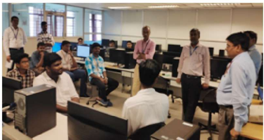
Value Added Courses – Red hat Linux