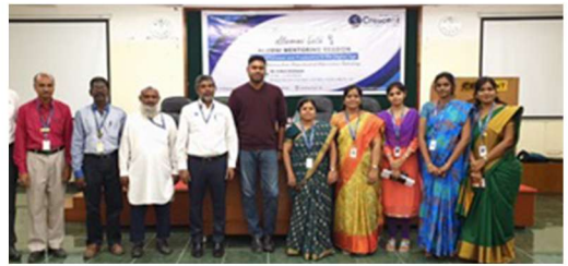
Motivational Seminars by Alumni