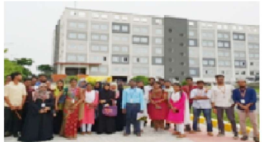
Industrial Visits by PG & UG students to a IoT based Firm.