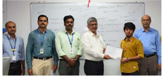
Certificate Awarding Function for Value Added Courses