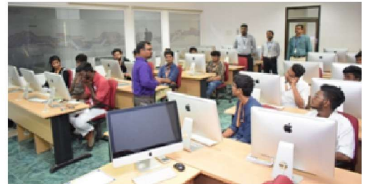
Value Added Courses – iOS Lab