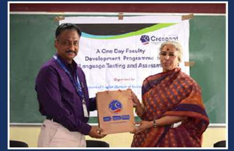
Inaugural Session of a one day Faculty Development Programme