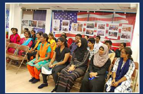
Our students at the American Library, Chennai