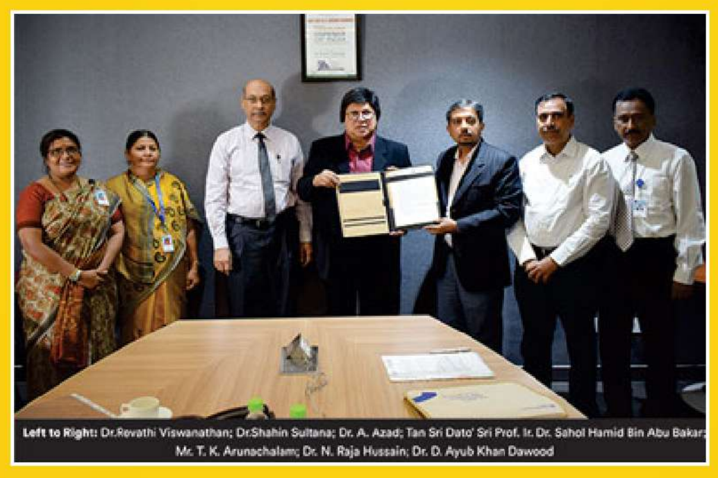
MoU with Cambridge Language Assessment in 2018

Our institution which has been functioning as BEC Centre since 2010 has been given the award "Preparation Centre Award 2019-2020" for Continuous Excellence in recognition of conducting the exams as per the standards set by Cambridge Assessment English.