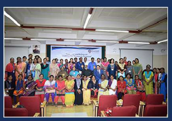
Participants of the workshop