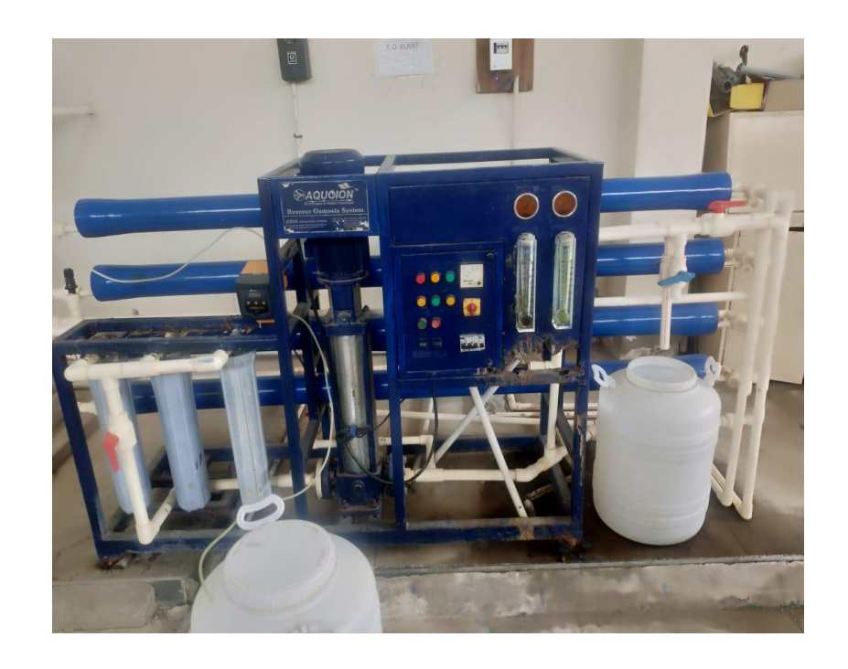
KBA MEN'S HOSTEL RO PLANT