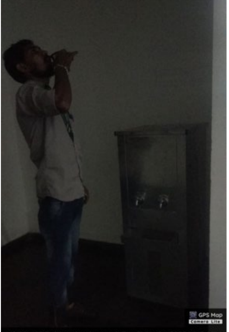
V3GP+69G, Peerakankaranai, Tamil Nadu 603210, India

Altitude -47.6 meters Thursday, 18-11-2021