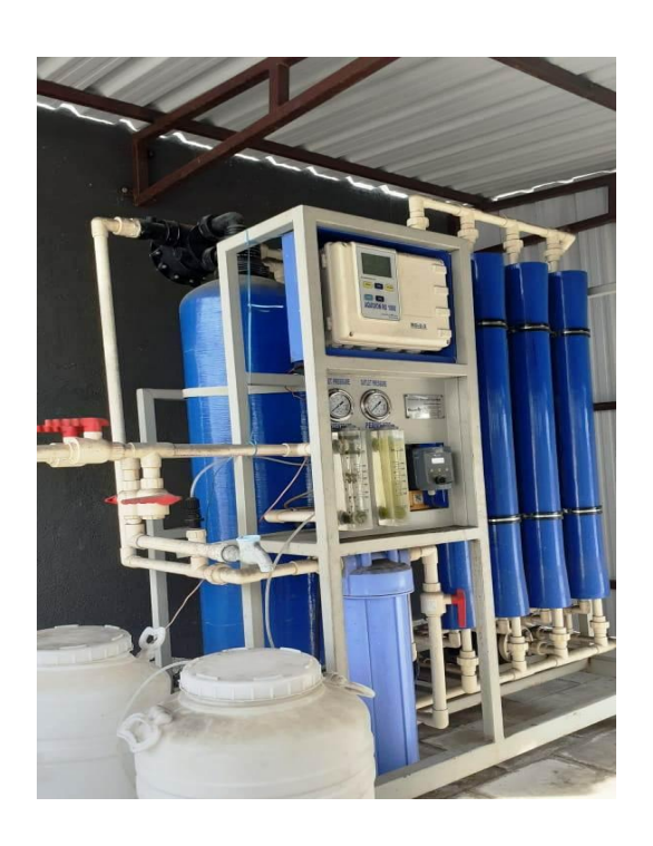
TBAK LADIES HOSTEL NEW BLOCK TERRACE RO PLANT