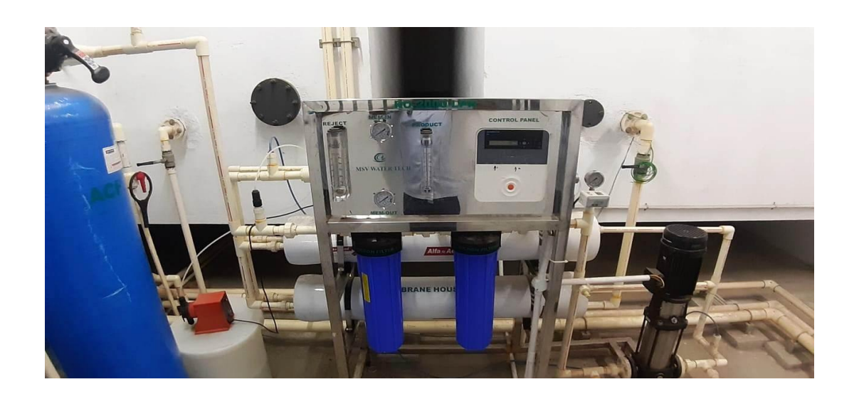
ARCHITECTURE BLOCK RO PLANT