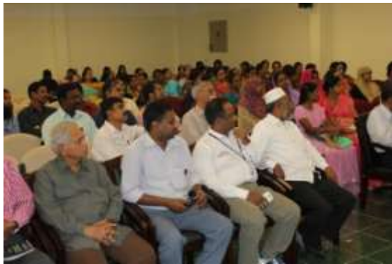
Senior Professors attended the workshop