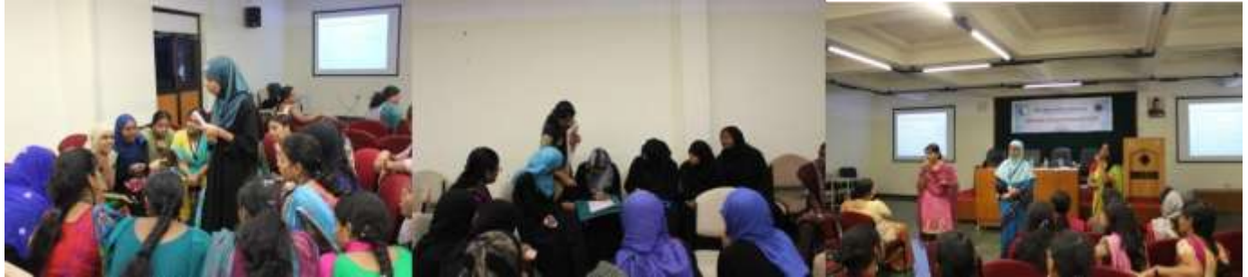
Group discussion and interaction session