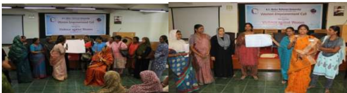
Group discussion and interaction

and co-ordination with the general public and civil society organizations. To check violence against women, women should be mentally and economically strong. So, the workshop “Violence against women” was organized on 16.06.13 to train the participants to overcome violence and protect themselves against violence. Many gentlemen of our University also attended the program. This program was published in the newspaper.