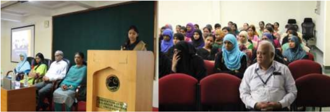
Inauguration of the workshop