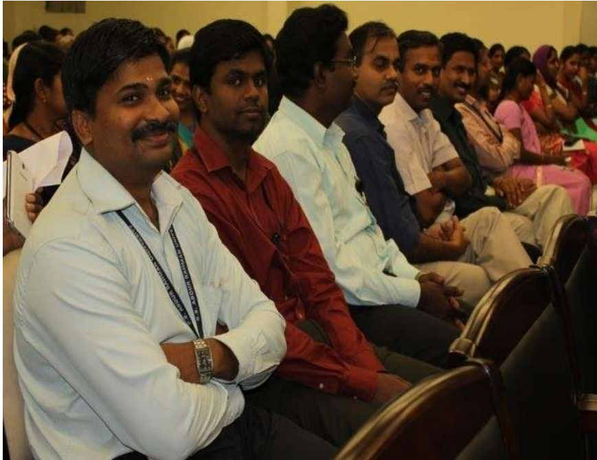
Interaction session with Male Faculty member(s)