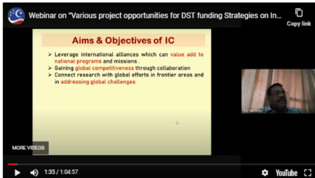
Webinar on “Various project opportunities for DST funding – Strategies on International cooperation”

Webinar recorded Video Link: https://youtu.be/HwyMIdzMhUE