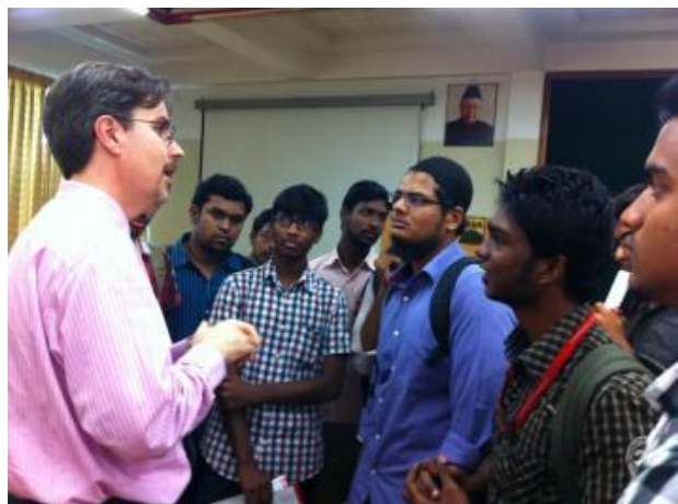
He delivered a special lecture on the title "On the Many Uses of Mobile Device Sensor Data" to the Students and Faculty from School of Computer, Information and Mathematical Sciences.